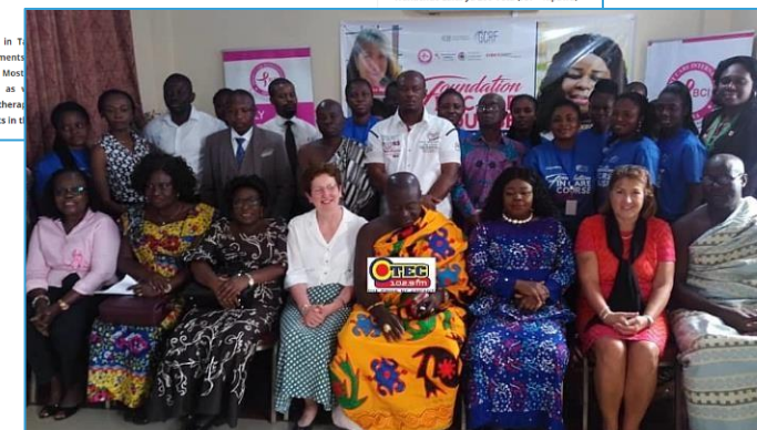
*Institute of Cancer Research, Royal Marsden NHS Foundation Trust, Ocean Road Cancer Institute, Peace and Love Hospital / Breast Care International, Macmillan Cancer Support